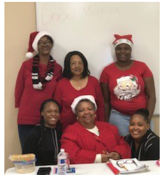
ADULT EDUCATION PROGRAM PARTICIPANTS

*Submitted by the Lafayette Housing Authority*